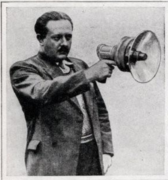
This death ray gun is said to be capable of stunning men or animals at one mile range. The queer magnesium pistol is being demonstrated in Paris by its German inventor.

A N ODD-LOOKING pistol firing a magnesium charge said to be capable of stunning men and animals a mile away is now being demonstrated in Paris. Its inventor, a German who was forced to flee from his native land, hopes to sell the idea to the French government.