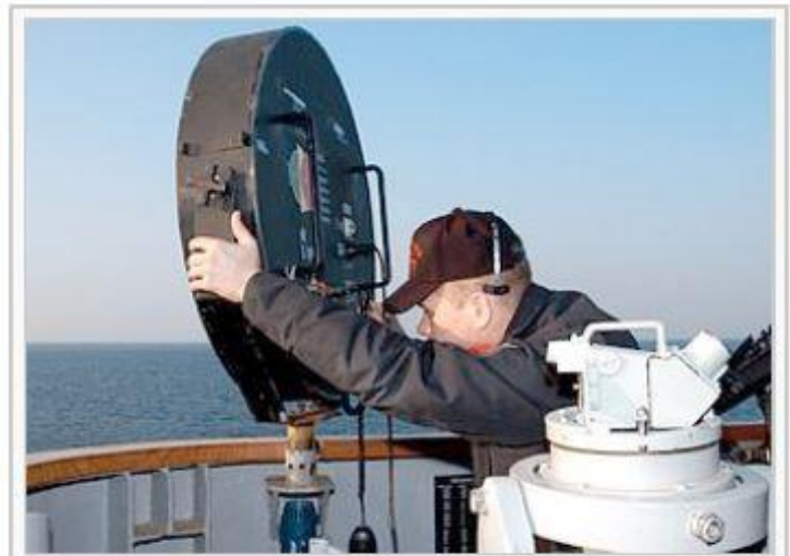
A Long-Range Acoustic Device (LRAD) in use on the USS Blue Ridge

Make sure that when you build and operate these systems, you know where everyone is in relation to the sonic cannon. The last thing you will want to do is have fellow survivors or family members in locations where they may be exposed to the sound waves.